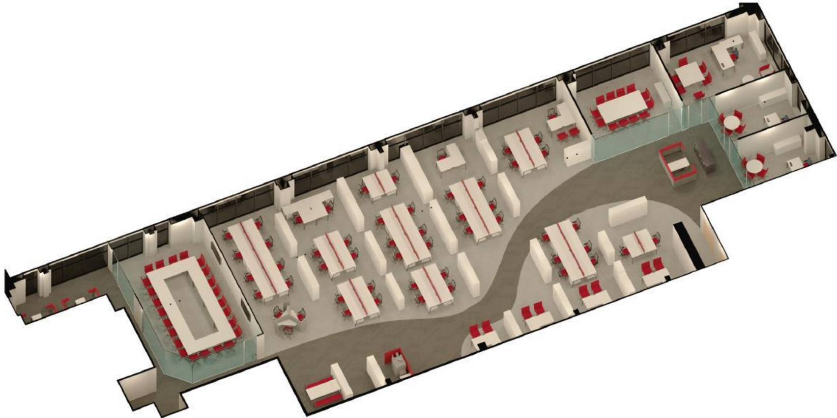
3D IMAGE OF PROPOSED FLOOR PLAN