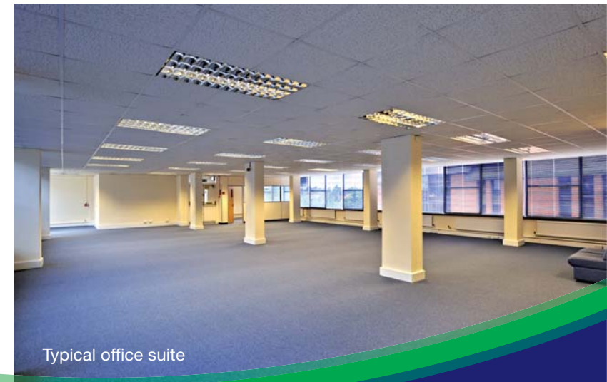
Typical office suite

A F F O R D A B L E F L E X I B I L I T Y I N W A T F O R D