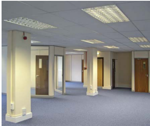
Typical office suite

130 sq ft - 4,867 sq ft (12 sq m - 452 sq m)