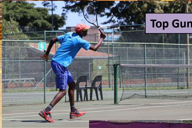
Top Guns 2017