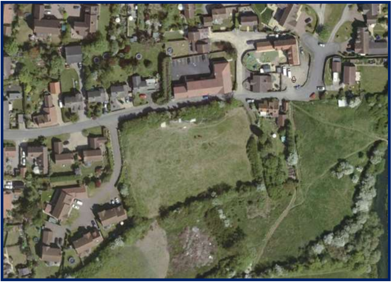
For Identification Purposes Only